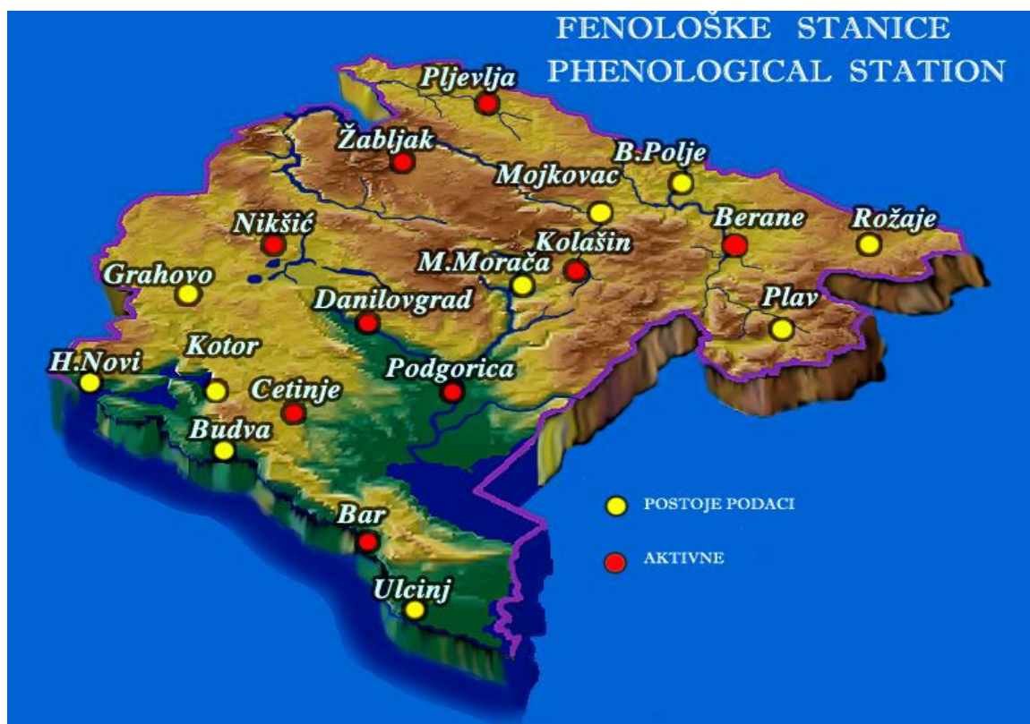
Spisak fenoloških stanica sa nadmorskom visinom i koordinatama